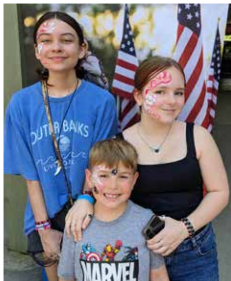
Military families creating lasting memories at the Cleveland Zoo during a day of connection, celebration, and support.