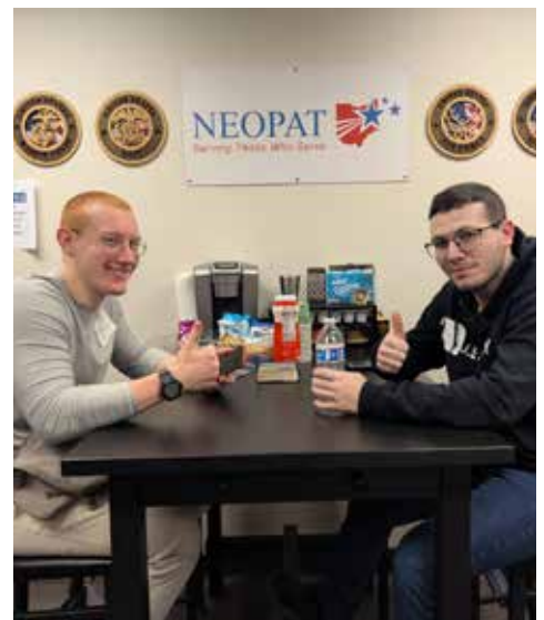
New recruits and families receiving resources at NEOPAT's Support Hub inside the Cleveland MEPS (Military Entrance Processing Station) - standing beside them from day one.