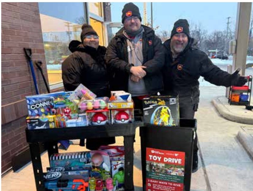
Members of the Sgt. Clean Car Wash team collecting gifts for the Adopt-A-Military-Family program.

Together, these outcomes demonstrate NEOPAT's continued commitment to Keeping the Promise—delivering timely, meaningful aid, and strengthening the well-being of veterans and military families throughout our community as we move into our 15th year of service.