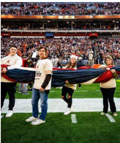
Veterans proudly carrying the flag at the Cleveland Browns Salute to Service game, honoring service while strengthening community ties.

NEOPAT's Lunch & Learn sessions brought together corporate partners, higher education leaders, and community stakeholders to share insights on veteran support, workforce engagement, and local resources.