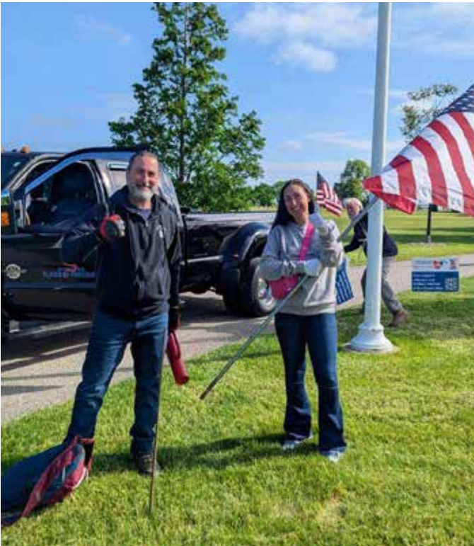
Volunteers installing flags at Edgewater Park for Memorial Day, each one a visible tribute to courage, sacrifice, and lives never forgotten.

Hosted a Gold Star Family Brunch to create a space of comfort, connection, and remembrance for families who have lost a service member.