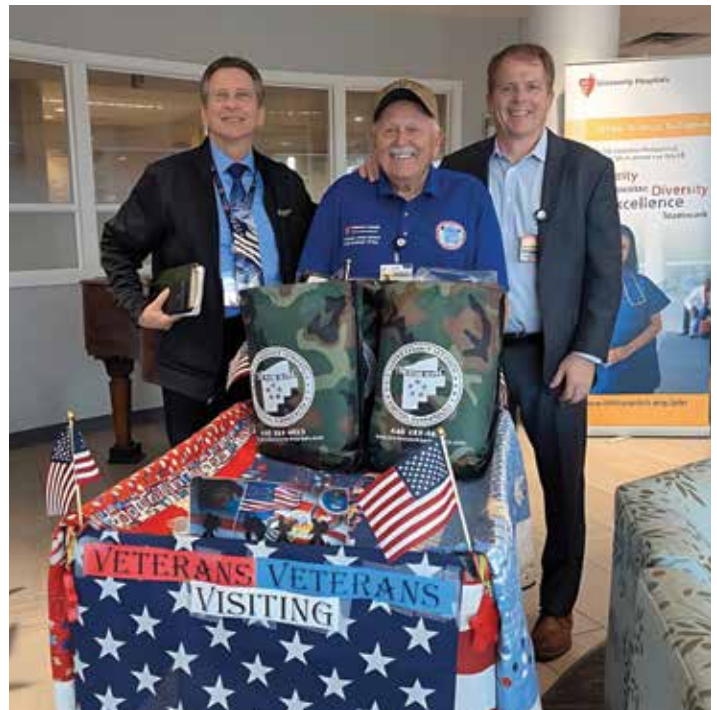
Team members making connections for the Veterans Visiting Veterans program at the UH Elyria Medical Center.