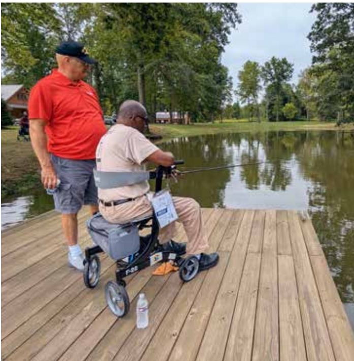
Veterans finding peace, purpose, and camaraderie on the water through NEOPAT's fishing experiences.

Through outdoor and fellowship experiences like fishing outings, the annual pheasant hunt, cabin fishing experiences, and outdoor rec, NEOPAT brought veterans together to promote camaraderie and peer connection in nature.