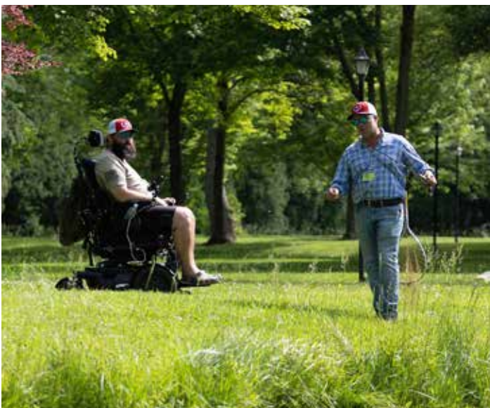
Adaptive fishing poles allow wounded veterans to enjoy fly fishing as part of our outdoor therapy programs.

NEOPAT proudly partnered with the Cleveland Cavaliers and Veterans Assurance Network to sponsor the Rally Against Suicide on September 22nd at Cleveland's Willard Free Stamp. Held in tribute to the 22 servicemembers lost to suicide daily, the event raised awareness, fostered support, and advocated for military mental health.