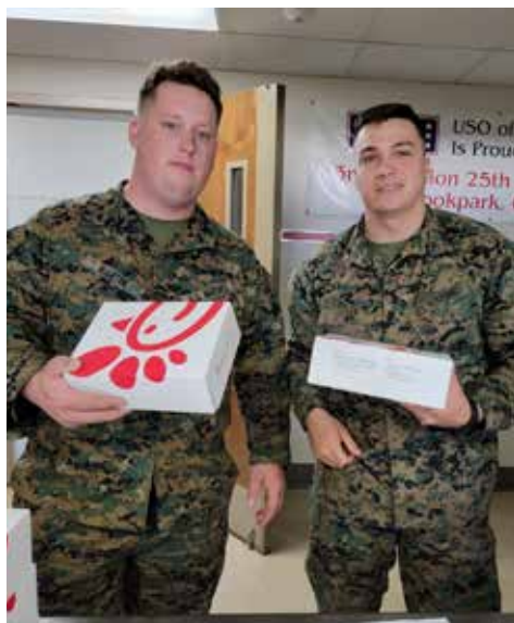
NEOPAT thanked the 3rd Battalion, 25th Marines in Brook Park, Ohio, with MRE's.

NEOPAT distributed 50 backpacks filled with school supplies to military families through our partnership with Volunteers of America Ohio. Alongside the giveaway, NEOPAT provided lunch for the Coast Guard, creating a meaningful opportunity to support servicemembers and their children as they prepared for the school year.