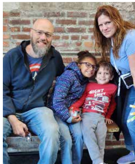
Military Family Fun Days allow military families to enjoy local museums and venues.