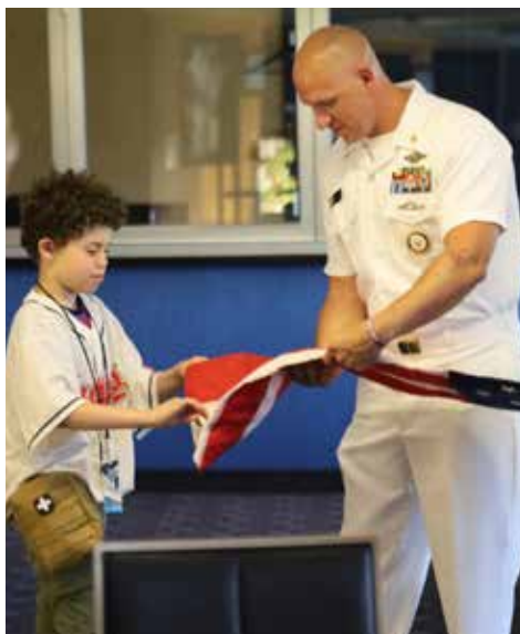
Coast Guard members educating our youth on flag folding and etiquette.