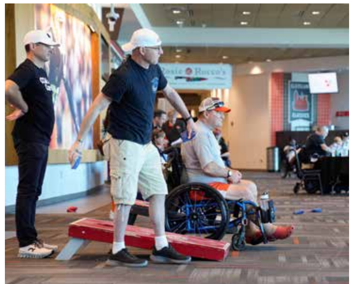
A cornhole tournament provided adaptive therapy for local disabled veterans as part of Military Appreciation Month.