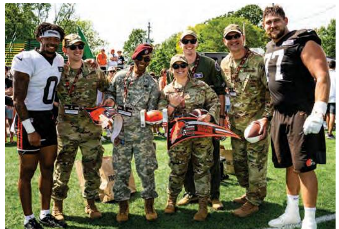
NEOPAT was honored to partner with the Cleveland Browns with over 200 local service members and Gold Star families in attendance at their special Military Appreciation Day during training camp.