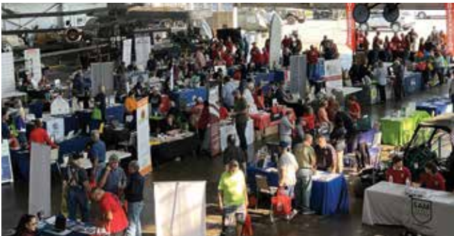
Veteran Resource Fair