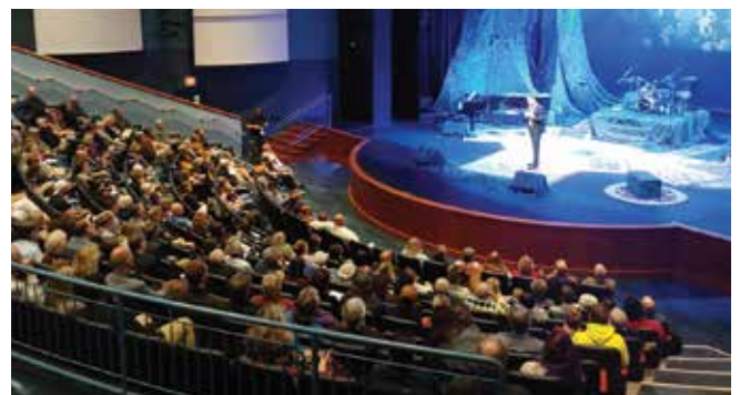
Modern Warrior LIVE