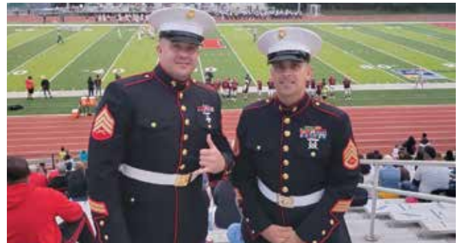
Cleveland Browns Game

"I'm so thankful to have been a part of handful of military events/halftime shows during and after my military career. I can honestly say of all the events, I have never felt more honored and blessed than I was yesterday. I know many felt the same way, so a HUGE thank you to NEOPAT and the NFL/Browns organization for instilling that feeling within myself. Please don't think twice about doing this again in the future, as your actions truly make a difference in the lives of a Soldier/Veteran."