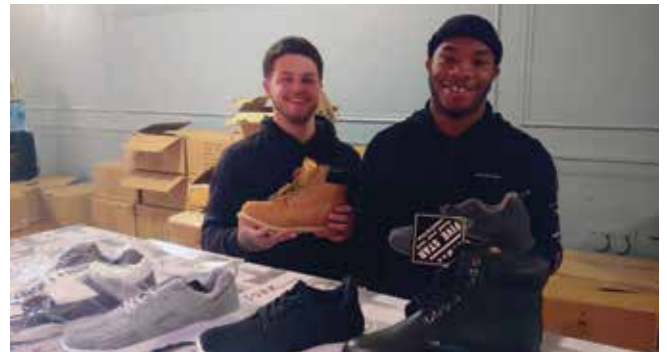
The City of Cleveland Veterans Day Resource Fair